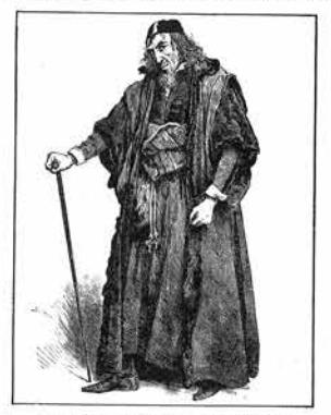
SHYLOCK IN "THE MERCHANT OF VENICE."