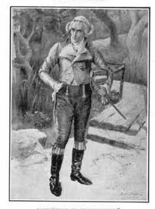
ROBESPIERRE IN "ROBESPIERRE." DRAWN BY RESNARD PARTHIOGE.