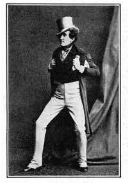
JINGLE IN "PICKWICK," ALBERY'S VERSION OF "THE PICKWICK PAPERS," PHOTOGRAPH BY LONDON STEREOSCOPIC CO.