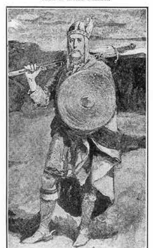
MAGRETH IN "MAGRETH,"