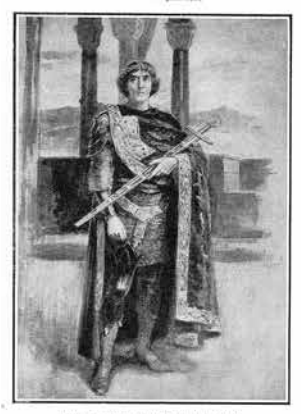
KING ARTHUR IN "KING ARTHUR,"