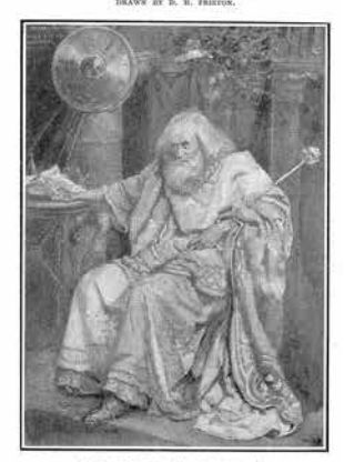
KING LEAR IN "KING LEAR."