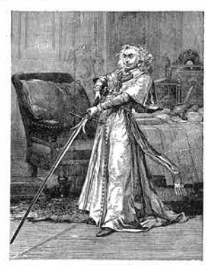
RECHELIEU IN "RICHELIEU,"