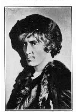
VANDERDECKEN IN "VANDERDECKEN."